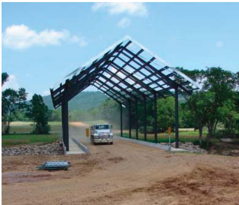
The frame of the Eagle Sky Bridge erected

As always, the road crew has been busy forging more beautiful road towards the future main entrance of Eagle Sky of the Ozarks. The crew has extended Eagle Sky Drive clear to Clark Creek where it runs near the highway, MO-34. From there, the crew has worked alongside the bridge contractors to erect